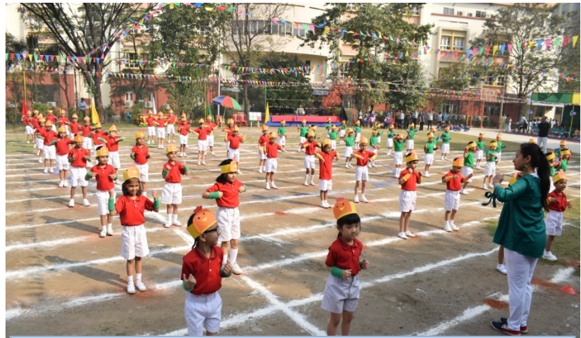
BIRDIE FLAP...Primary Drill Display

The Sports Day ended with the lowering of the school flag until next year. It was a memorable, momentous, and fun filled day for all at CIS - a day of achievements, of success, of sportsmanship, of joy and great happiness, of teamwork and healthy competition.