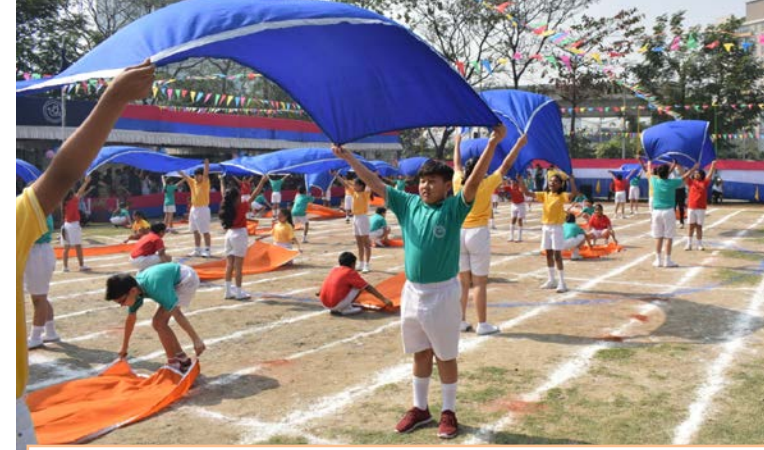
VIBRANT WAVES... Drill Display by Classes 3 and 4